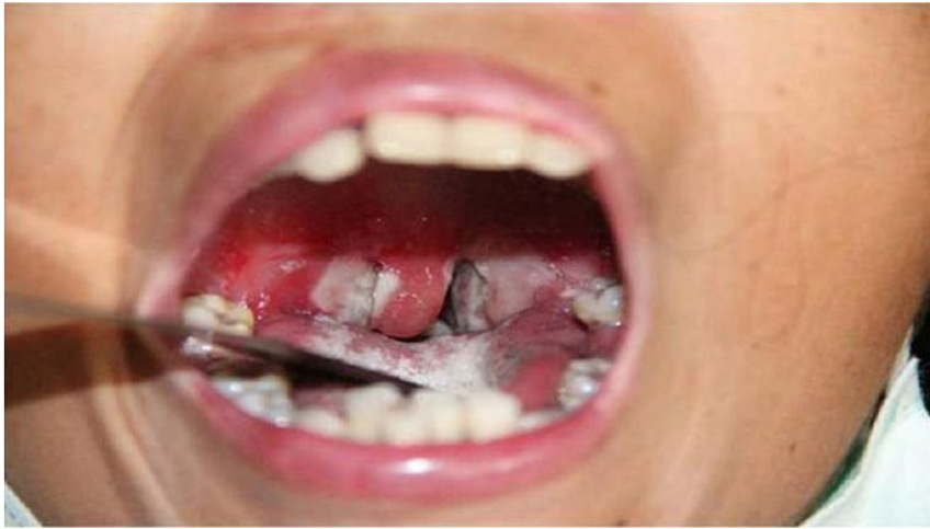
Figure 2: Example of the adherent membrane of diphtheria